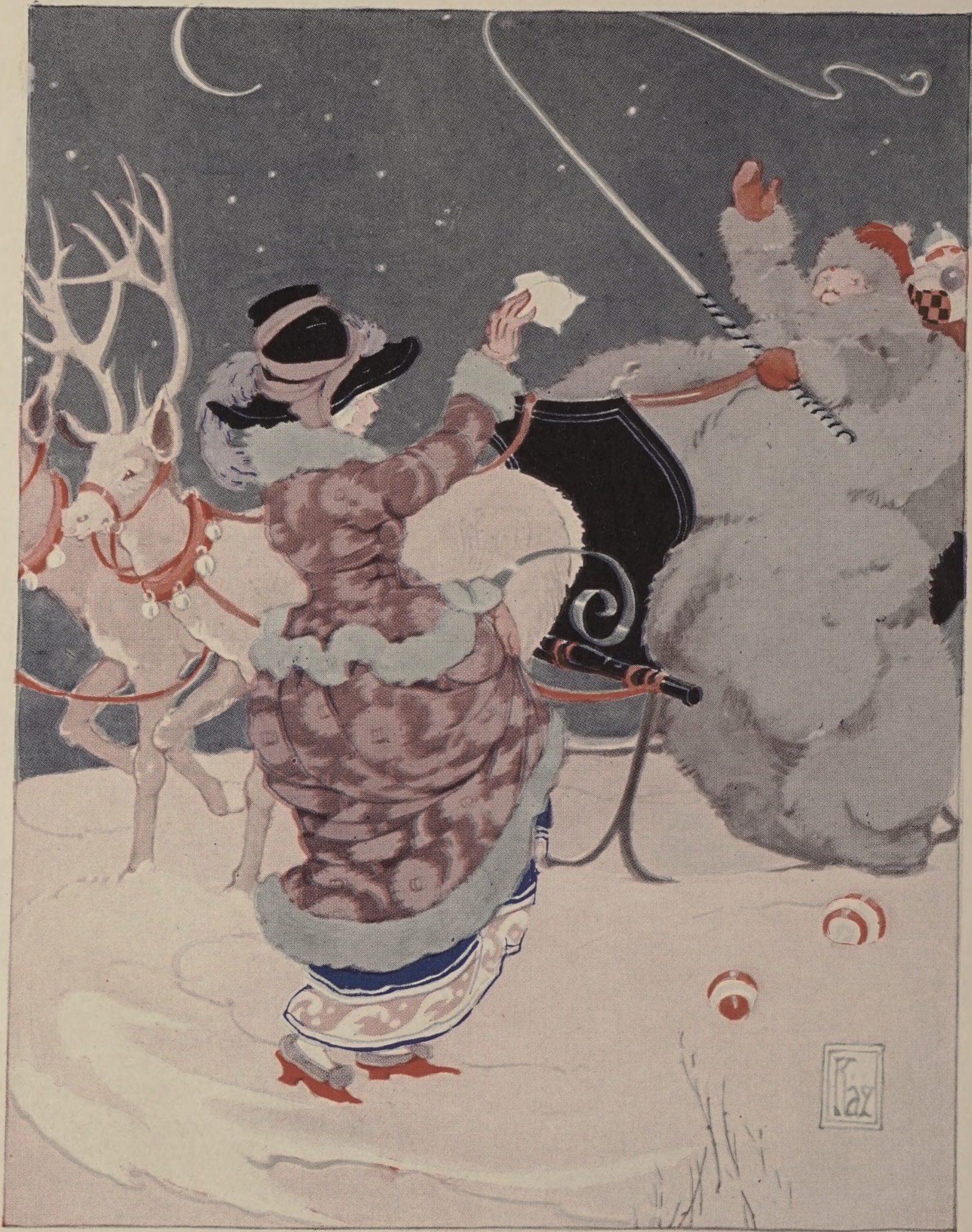
Santa, driving the reindeer with one hand, and waving to Mrs. Claus with the other